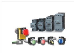
LOW VOLTAGE CONTROL