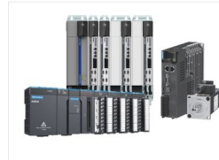
MOTION CONTROL &amp; SERVO