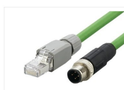
CABLES &amp; CONNECTORS