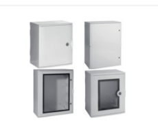
CABINETS &amp; TOWER LIGHTING