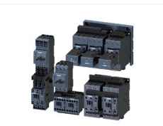
SWITCHGEAR &amp; CIRCUIT PROTECTION