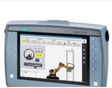
HMI'S &amp; INDUSTRIAL PC'S