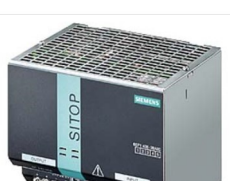
POWER SUPPLIES &amp; UPS'S